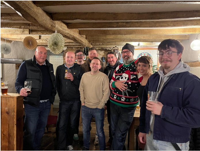
Members of the 46 Bus, Pub Crawl Group. Seen here taking a well deserved 'pit stop' !